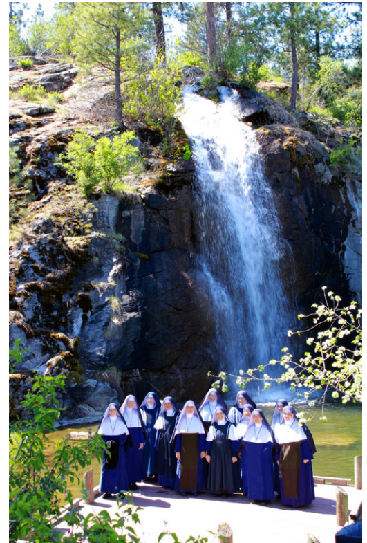
A picnic on the feast of the Ascension is one of our annual traditions. The park we visited this year featured a lovely waterfall and many trails.

The final Glorious mysteries, the Assumption and Coronation of Mary, fittingly draw our focus to the Mother of Divine Grace, our own Mother Mary. As our mothers care for and nourish our bodily life, so Mary wishes to protect and increase the supernatural life of grace in our souls. Let us always turn to her in our own preparation for the sacraments, especially when we receive her Son in the Holy Eucharist. What better welcome can we offer to Jesus, than to unite with the love, adoration and gratitude of His beloved Mother?