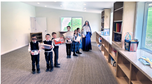
Students at Mary Immaculate Queen Academy, help their teachers move into their new classrooms.