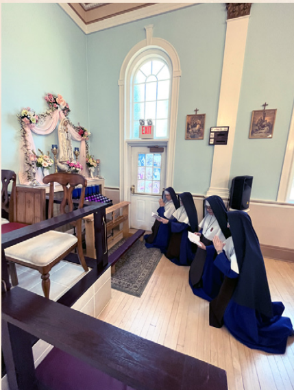
At the Fatima May shrine in Salem, the Sisters in New England renew their Total Consecration on the feast of Mary Immaculate Queen.