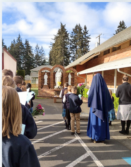
Students and faculty at St. Mary's Academy in Tacoma, Washington, recite the Little Crown of the Blessed Virgin Mary at their Marian shrine.