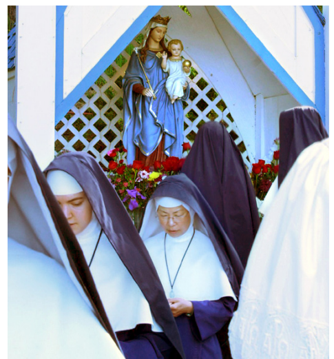
On Memorial Day, the Sisters from Mount St. Michael joined Mary Immaculate Queen Parish for their procession and presentation of flowers in honor of Our Lady's Queenship.