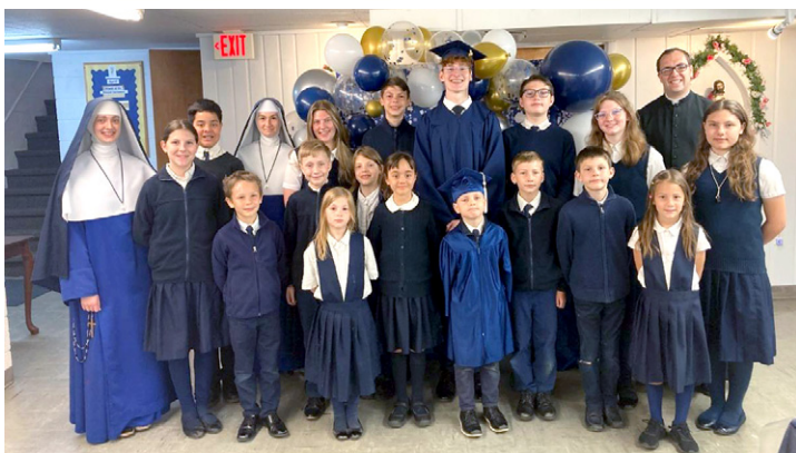
With much joy, students and faculty of St. Philomena's Academy in Middleville, Michigan, celebrate graduation and the last day of school.