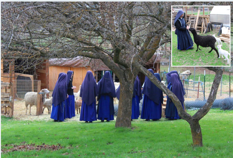
A flock of nuns meets a flock of sheep. During Easter week, the Sisters enjoyed an afternoon at the Novitiate and were excited to see the many lambs.