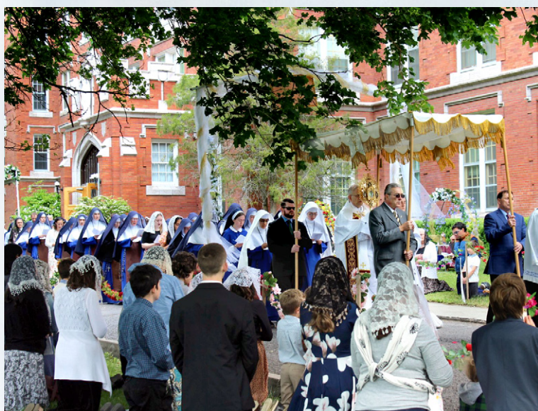
On Corpus Christi at Mount St. Michael, the Sisters and choir process behind the Blessed Sacrament while the faithful kneel in adoration.