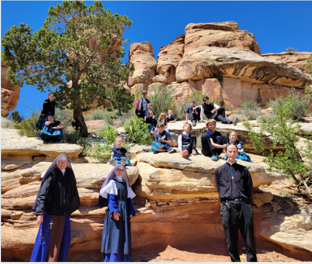
Holy Guardian Angels' School, Olathe, take a break from their books to enjoy God's creation at the Colorado National Monument.